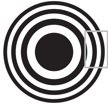
Figure 3: Michelson interferometer fringe pattern. What you are likely to see at first is a band of almost straight fringes, such as are shown within the grey box. What you then want to do is to adjust the tilt of M1 to get closer to the center of the fringe pattern, until at the end you get fringes that look like concentric rings as shown at right. Note that the center fringe can be bright, or it could be dark (it changes every time the net optical path length changes by \lambda/2 ).